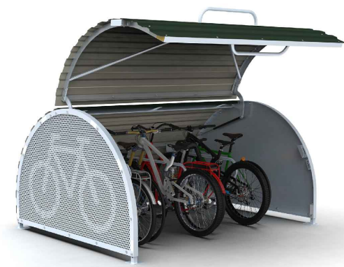
Bike Store - 3D image