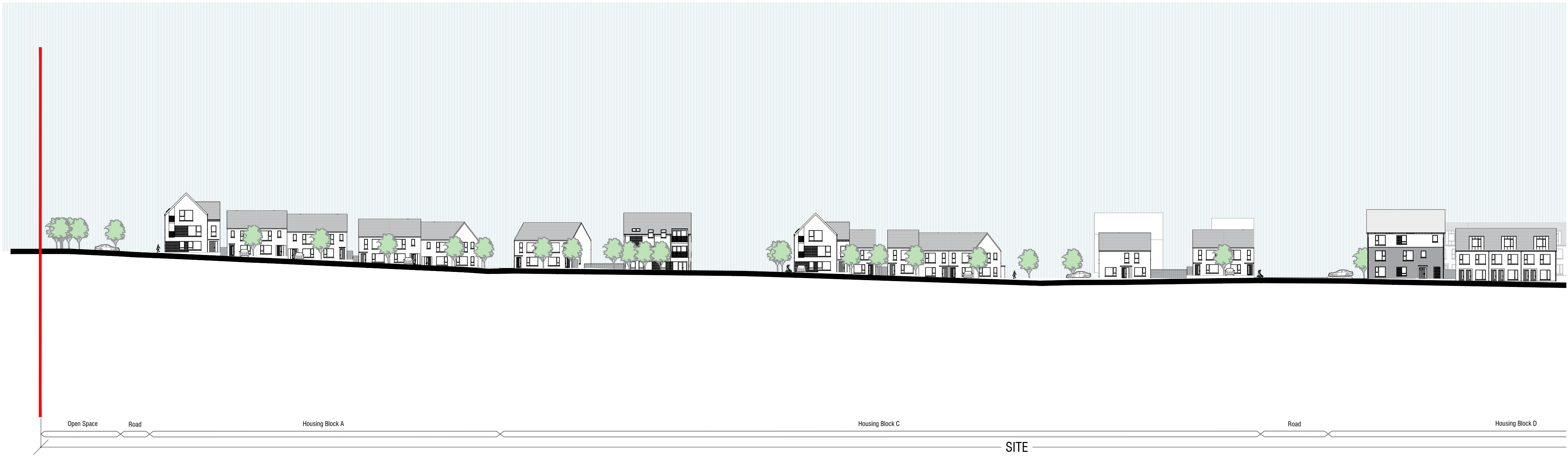
SECTION A - A SCALE 1:500 @ A0