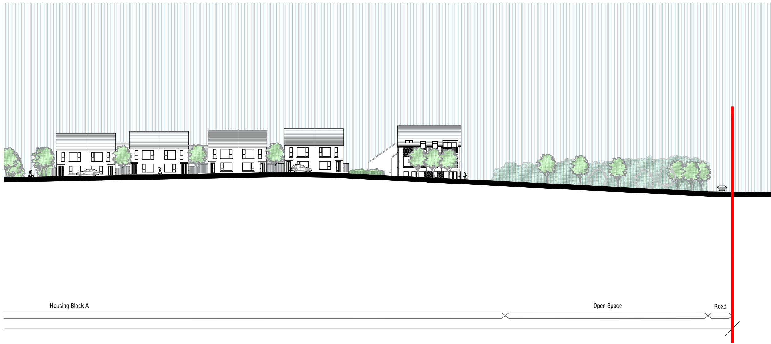
SECTION C - C CONTINUED SCALE 1:500 @ A0